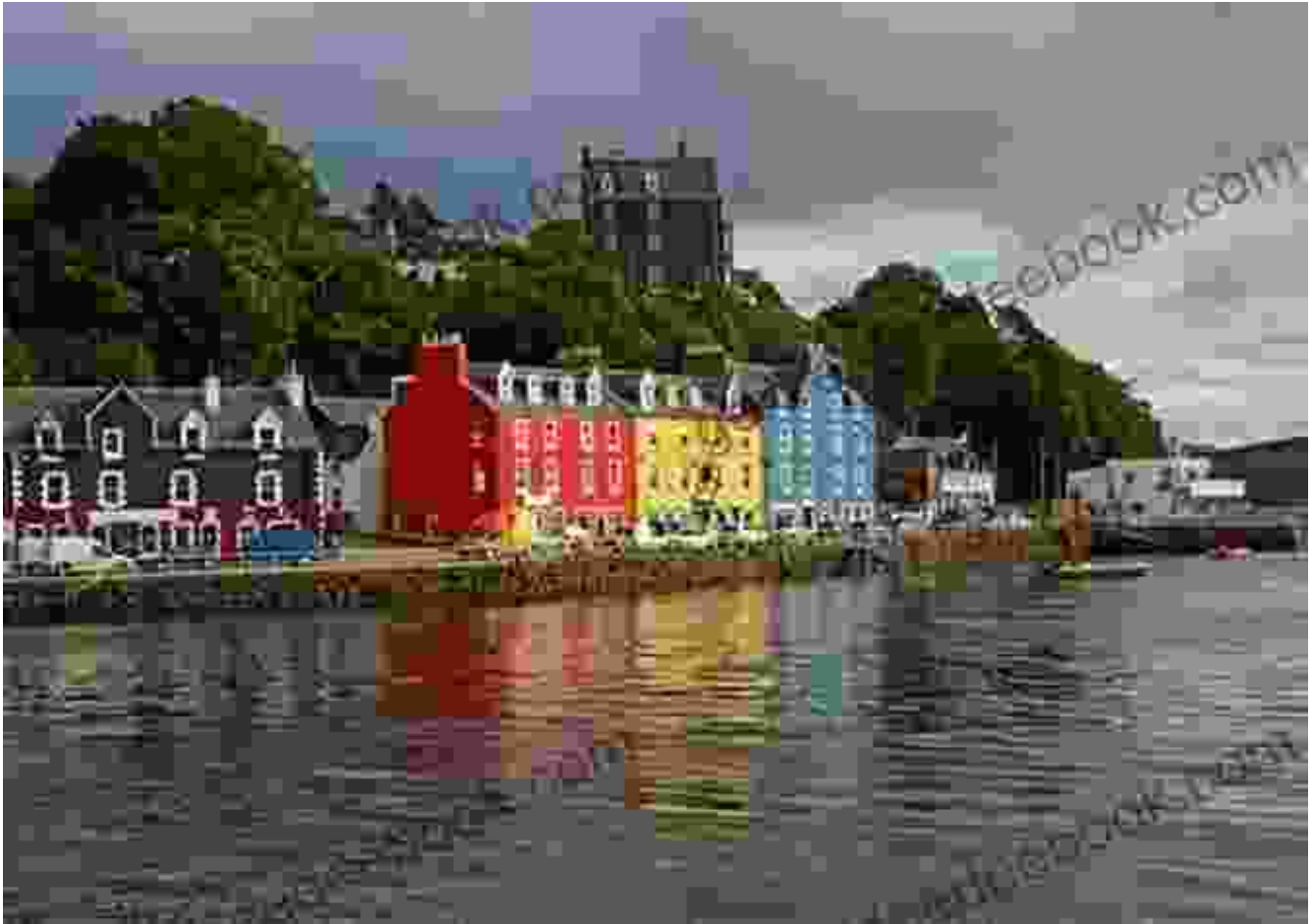
St. Michaels, Maryland