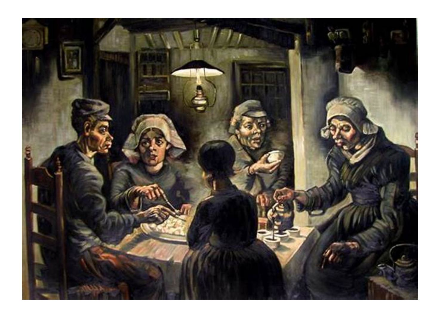
"The Potato Eaters" by Vincent Van Gogh, 1885

Painted in the early stages of Van Gogh's career, "The Potato Eaters" depicts a humble peasant family gathered around a meager meal of potatoes. The painting is characterized by its dark, earthy tones and its depiction of the laborers' worn and weathered faces. Through this work,