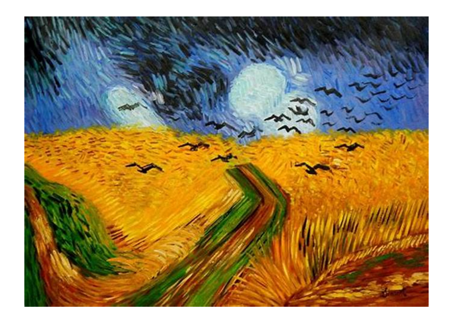
"Wheatfield with Crows" by Vincent Van Gogh, 1890

Created shortly before Van Gogh's death, "Wheatfield with Crows" is a poignant and haunting depiction of a field under a threatening sky. The swirling brushstrokes and the ominous crows in the distance create a sense of tension and unease. This painting is often interpreted as a reflection of Van Gogh's own mental anguish and his impending suicide.