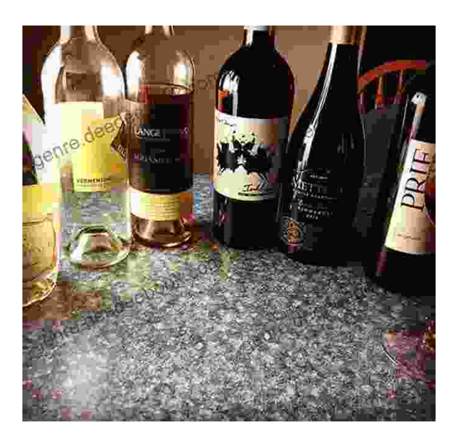
Indulge in the perfect harmony of Lodi wines and locally sourced culinary delights.

Lodi's culinary scene is as diverse and captivating as its wines. We ventured to The Dancing Fox, a charming restaurant in the heart of Lodi, for a lunch that showcased the region's fresh produce and artisanal cheeses. Each dish was expertly paired with a Lodi Sauvignon Blanc or Pinot Noir, creating a symphony of flavors that tantalized our taste buds.