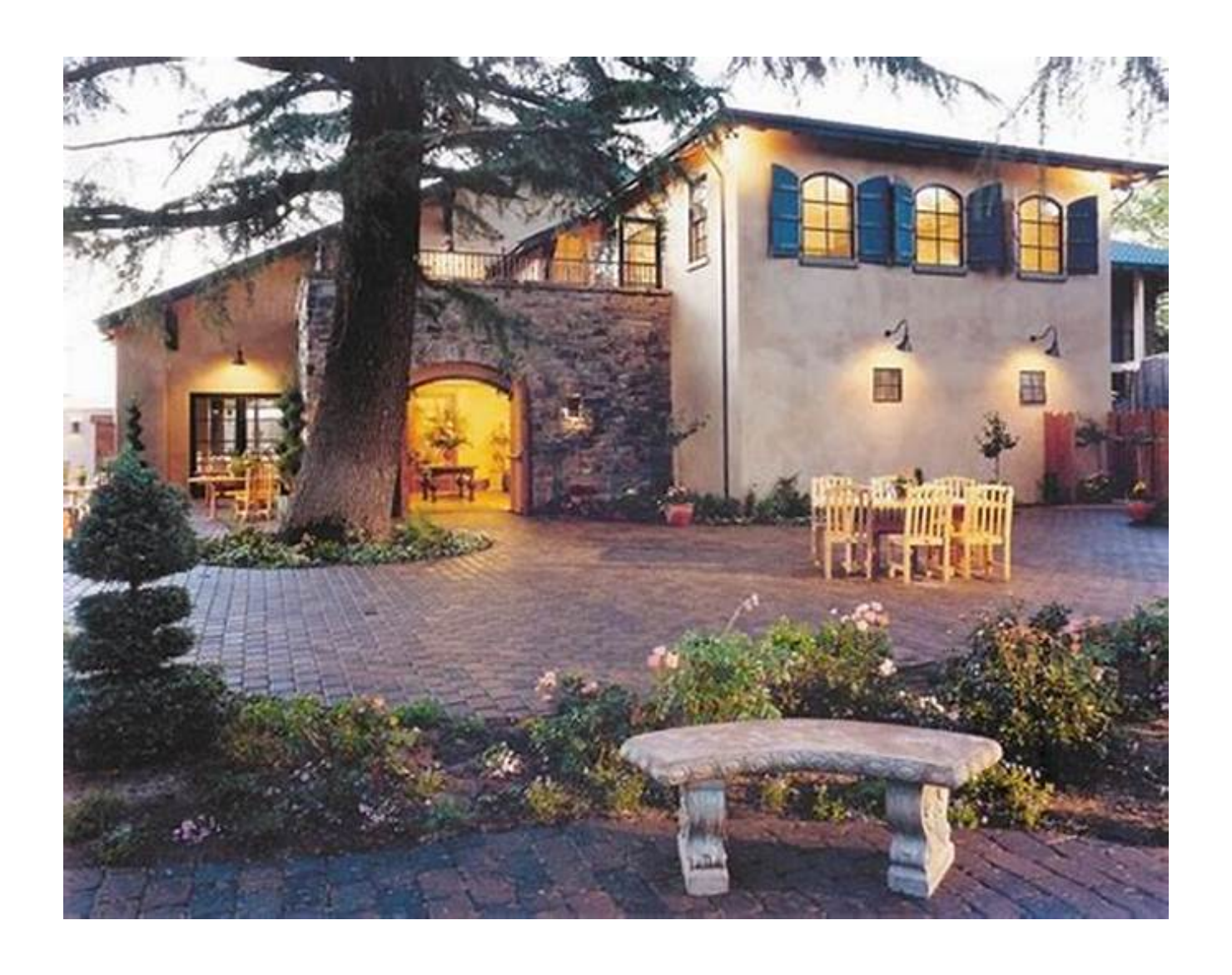
Wine & Roses Hotel, a haven of tranquility beneath the twinkling night sky.

As night fell, we checked into the opulent Wine & Roses Hotel, a four-star sanctuary nestled amidst the vineyards. The hotel's elegant ambiance and impeccable service set the perfect stage for a starlit evening. As we sipped on a glass of Lodi Zinfandel by the fireplace, the flickering flames cast a warm glow on our surroundings, creating a moment of pure bliss.