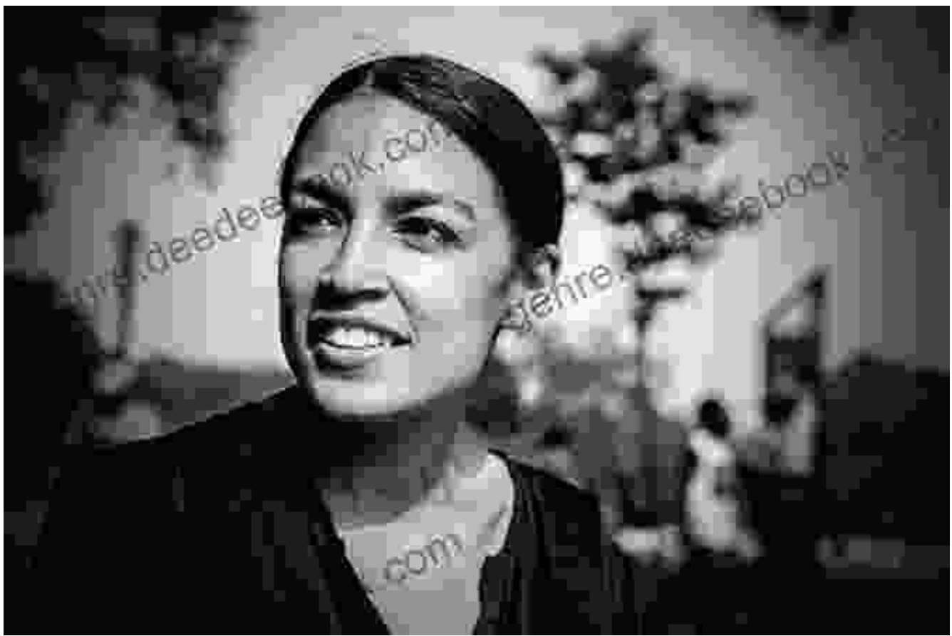
The Cornerstones of AOC's Political Success

AOC's remarkable success is not merely a matter of luck or circumstance. It is the culmination of carefully crafted strategies, unwavering principles, and a deep-rooted commitment to empowering marginalized communities.