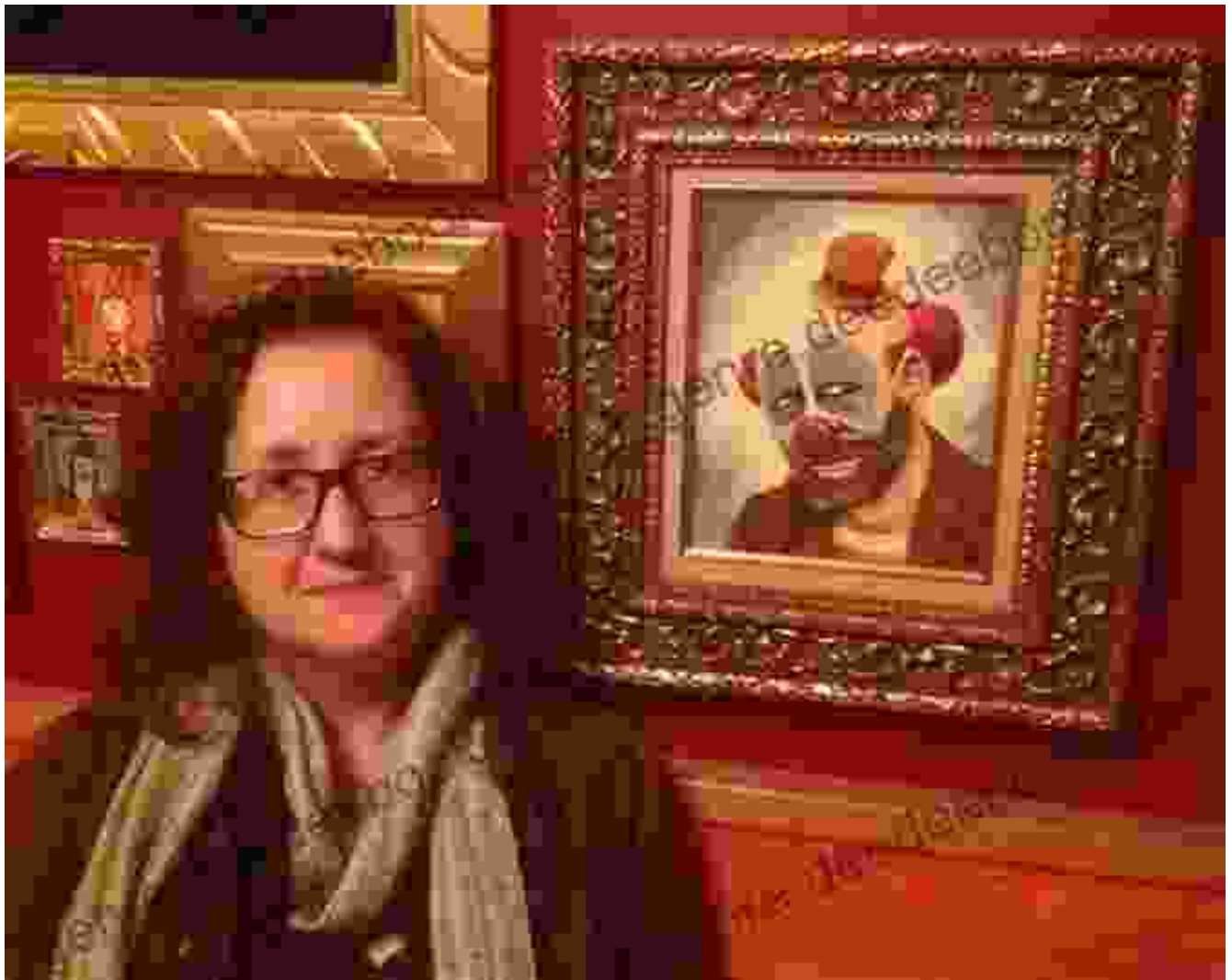
Masquerade III , oil on canvas, 1996