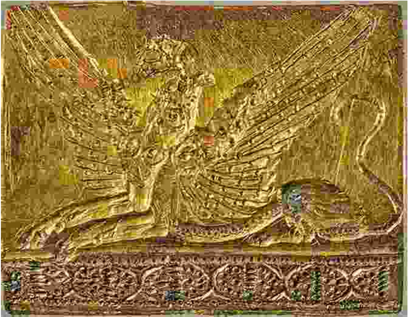
Illustration showcasing the artistic techniques used to create the My Greek Seal, such as intaglio engraving and relief carving.