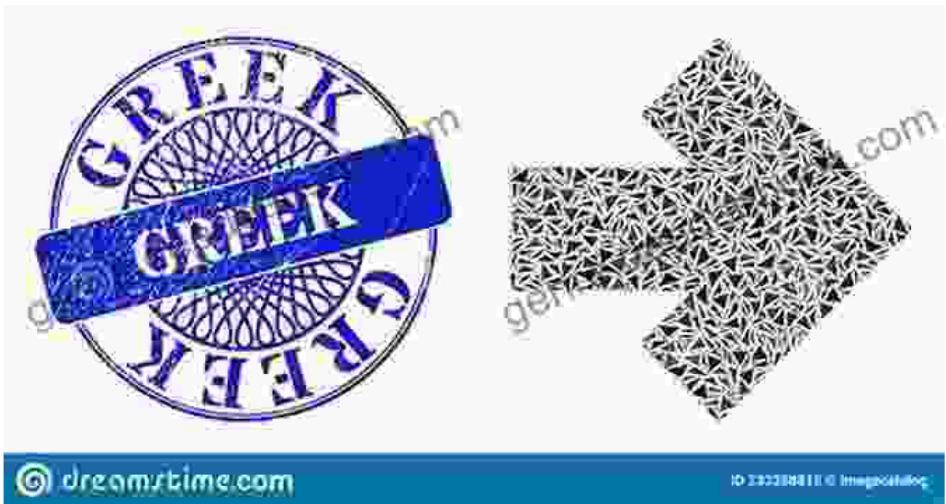
Illustration depicting the enduring influence of the My Greek Seal on subsequent cultures and art forms.